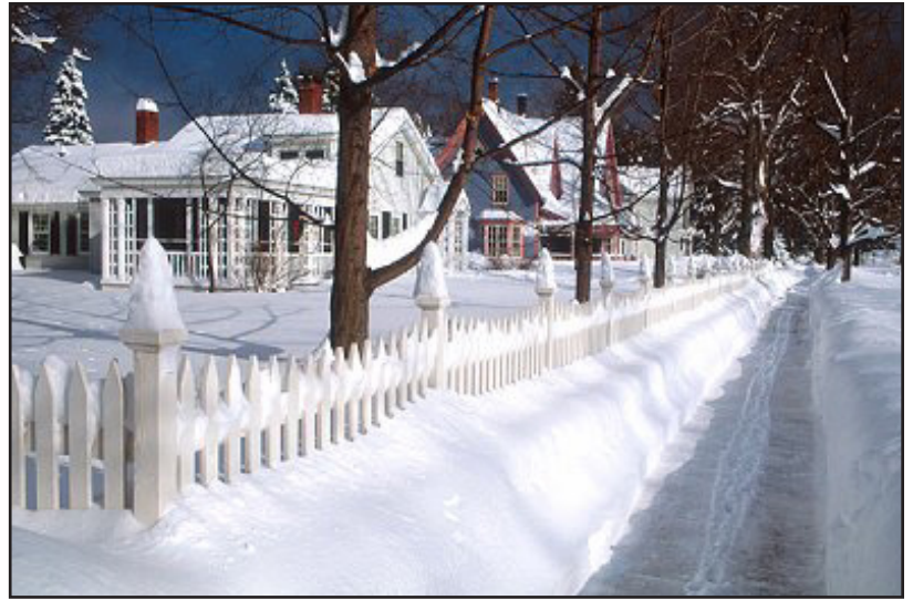
Lines can be used to direct the viewer's eye from one spot to another.

The Compositional Rule of Thumb: There are, of course many ways to compose your subject, but if you have a good understanding of how to use line, shape, or texture to your advantage, your compositions are far more likely to have impact than if you did not use them.